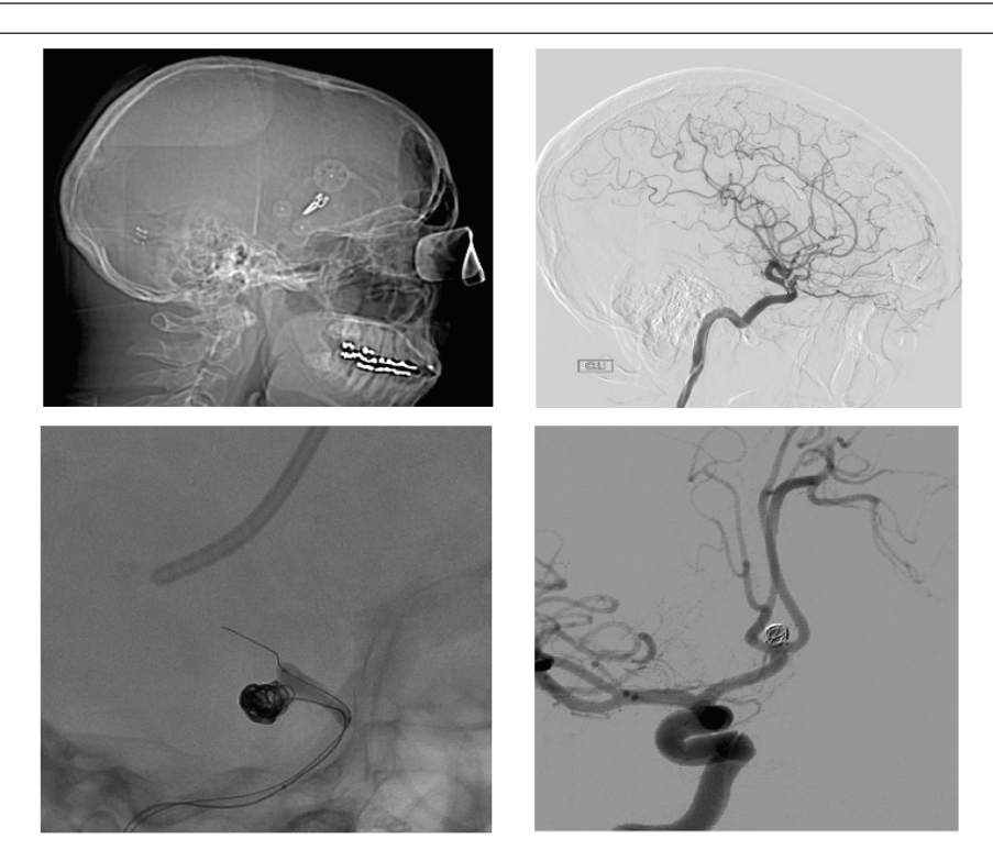
Figure 2: Surgical treatment in upper images and endovascular embolization in lower images.

analyzing those who truly re-bled post-treatment (clipping = 2.35% versus embolized = 11.54%, p <0.006), although it is true that the sample is small, so this feature remains pending confirmation.